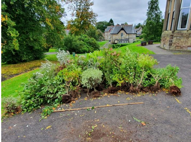
A selection of some of the beautiful shrubs and plants which were kindly donated by Cala Homes