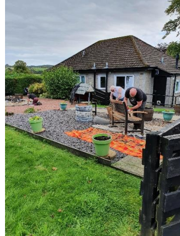
Members of the Widows Sons West hard at work

Latest news from the Scottish Constitution Freemasonry Supports Facebook page is as follows –